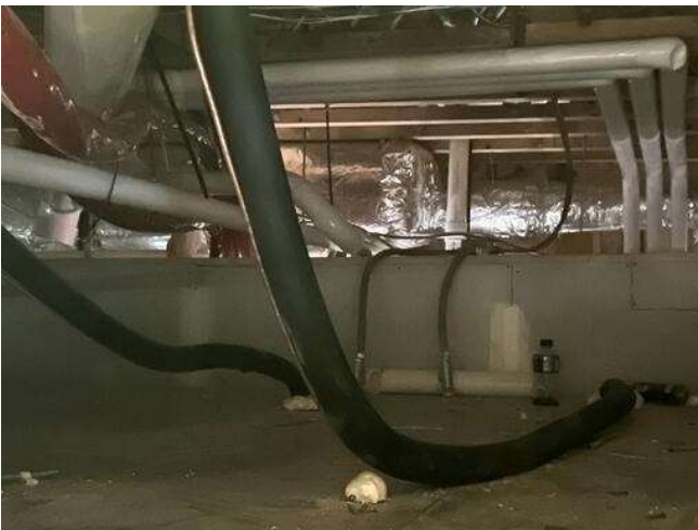
IMG_3114 Joe Spagnoli Nov 19, 2024 11:43 AM