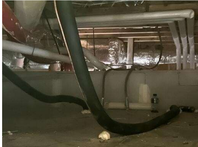
IMG_3114 Joe Spagnoli Nov 19, 2024 11:43 AM