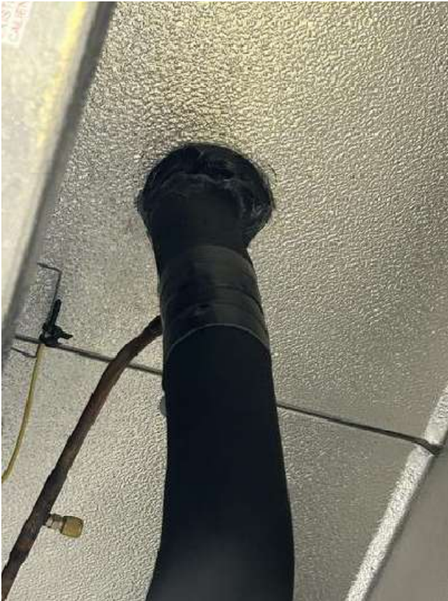
IMG_3116 Joe Spagnoli Nov 19, 2024 12:16 PM